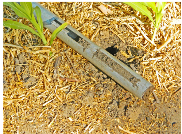
Remove the steel pipe from the soil and use the slots to inspect the moisture level in the core sample and the position of the wetting front.