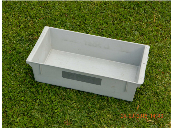
Measured irrigation evaporator