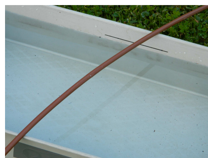
Water level below level line

If the garden requires less frequent watering, you may choose not to irrigate on certain evenings. If the garden requires more frequent watering, you may choose to irrigate during the day as well as at sunset (for example if the weather is very hot and dry).