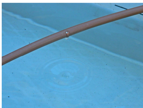
Start irrigating at sunset