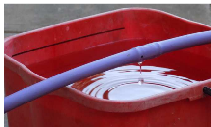
The evaporator may simply be a bucket

The volume of water delivered by each dripper in your garden during an irrigation event is the same as the volume of water delivered to the evaporator by the control dripper.