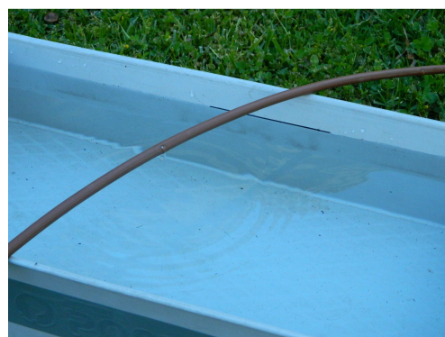
Stop irrigating when the water level reaches the level line