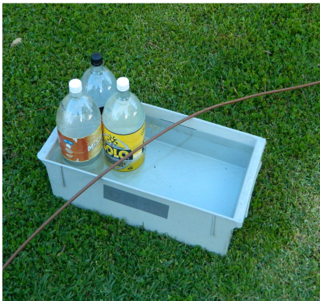
In this case 3 large drinking bottles have been used to adjust the surface area of evaporation.