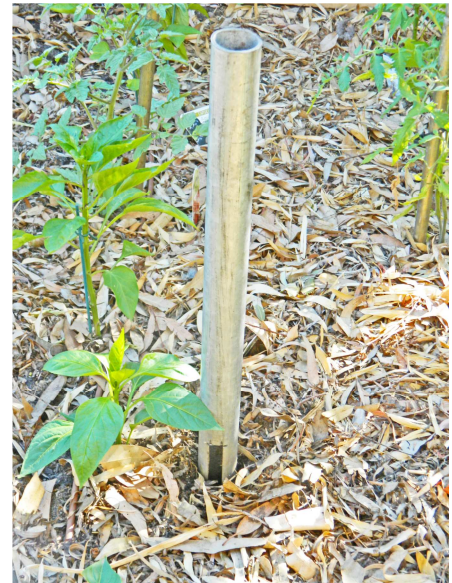
Early in the morning after irrigation the night before, push (or hammer) the steel pipe into the soil near a dripper.

As your crop grows and the water requirement of the crop changes, you may wish to repeat the process of adjusting the surface area of evaporation.