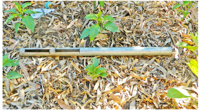
An angle grinder can be used to cut some slots in a length of steel pipe.

To take account of all these additional factors, I recommend that you use a length of steel pipe to check the moisture level in the soil. I suggest that the diameter of the pipe be between 40 and 50 mm. An angle grinder can be used to cut some slots in the steel pipe to that you can inspect the core sample of soil inside the pipe. I suggest that the width of the slots be about 13 mm.