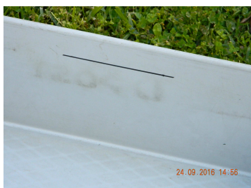
Level line on inside of evaporator

Draw a level line on the inside of the evaporator about 3 cm below the overflow level.