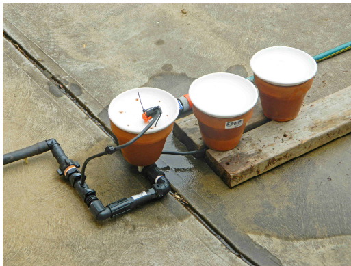
With two additional pots the discharge during the irrigation event is slightly more than trebled.

One way of connecting the pots is to drill a 10 mm hole in the bottom of the pots and to use 6 mm ID (10 mm OD) rubber grommets, 6 mm barbed elbows and 6 mm flexible tubing. The drain hole in the additional pots should be sealed.