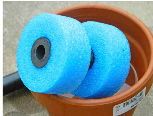
Float showing the ring magnet at the bottom of the float

This remarkable low-cost invention may enable poor smallholders in remote locations to grow higher-valued crops cost-effectively.