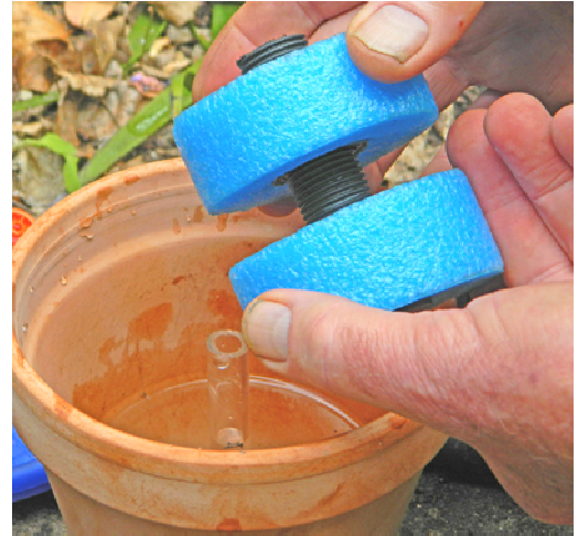
To adjust the interval between irrigation events, adjust the gap between the upper and lower floats

Adjusting the interval between irrigation events does not change the water usage rate. For example, if you decrease the interval between irrigation events by increasing the gap between the upper and lower floats, the amount of water used during the irrigation event increases automatically to ensure that the water usage rate (litres per week for example) remains the same.