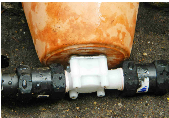
Unpowered Terracotta Irrigation Controller showing the valve and the 15 mm inlet and outlet

The valve under the Unpowered Terracotta Irrigation Controller has a 15 mm inlet and outlet, and so it is not suitable for large irrigation applications that require a bigger valve. If the flow rate through the valve is inadequate, you may wish to subdivide the irrigation application into zones with one Unpowered Terracotta Irrigation Controller for each zone.