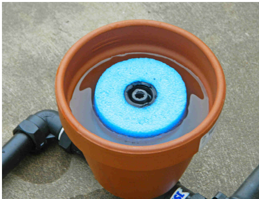
Unpowered Terracotta Irrigation Controller showing the float and the water level

Terracotta is porous and so the water level in the pot falls as water seeps through the pot. A float inside the pot floats on the water. When the water level reaches the low level, a magnet inside the float activates the valve so that the valve opens and the irrigation starts. During the irrigation event a control dripper drips water into the pot and the water level rises. When the water level reaches the high level, the magnet inside the float disengages from the valve so that the valve closes and the irrigation stops.