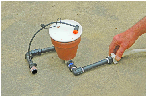
Connect the water supply to the inlet pipe

Connect the water supply to the inlet pipe and connect the irrigation application to the outlet pipe (note that the control dripper is connected to the outlet pipe).