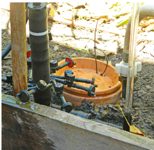
Fraction 1/8 for online drippers (8 open lower drippers, one lower dripper as control dripper) water supply pressure 40 kPa

The following pictures provide examples of fully assembled fractional dripper being used as the control dripper for the Terracotta Irrigation Controller.