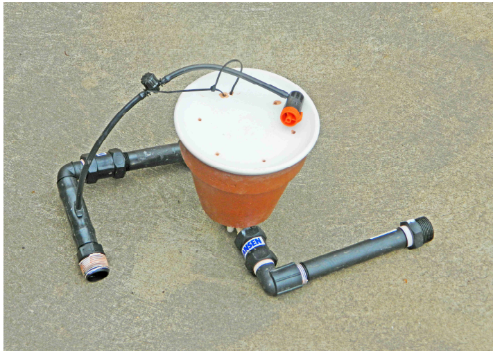
Above ground installation of the Unpowered Terracotta Irrigation Controller