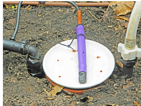
The adjustable control dripper has been replaced by an in-line irrigation dripper.

The terracotta pot is quite small and so the control volume is restricted to the range 77 ml to 300 ml. Because each irrigation dripper discharges the control volume of water during the irrigation event, the water usage rate is often insufficient for your plants at their current stage of growth.