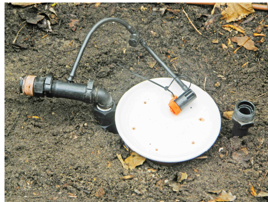
Step 2. Adjust the inlet and outlet pipes so that they are vertical. Position the controller in the hole so that rim of the pot is above ground level. Back fill the soil around the pot.