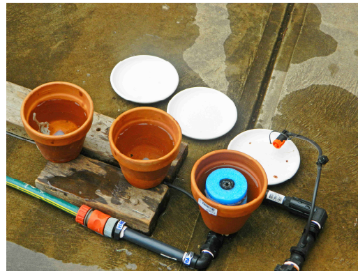
The pots are connected by 6 mm flexible tubing so that the water level is the same in all the pots.