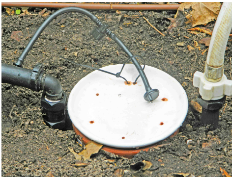
The adjustable control dripper has been replaced by an on-line irrigation dripper.

By using the Unpowered Terracotta Irrigation Controller in this way, many zones with PC drippers can be combined into a single zone with NPC drippers and a single Unpowered Terracotta Irrigation Controller, and so the cost of the irrigation system can be reduced dramatically.