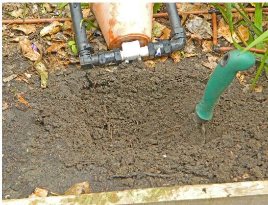
Step 1. Dig a hole midway between two adjacent plants. There should be no irrigation drippers near these two plants.

In ground installation is ideal for drip irrigation of row crops. Follow the installation steps below.