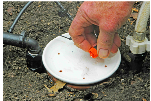
The control dripper is adjustable.

It is important to note here that the control dripper is adjustable. If you reduce the flow rate of the control dripper, it takes a lot longer for the control volume of water to drip into the pot and so the duration of the irrigation event increases and your plants get more water. On the other hand, if you increase the flow rate of the control dripper, the control volume of water drips into the pot more quickly and so the duration of the irrigation event decreases and your plants get less water. Adjust the control dripper so that the irrigation delivers the appropriate amount of water to your plants at their current stage of growth.