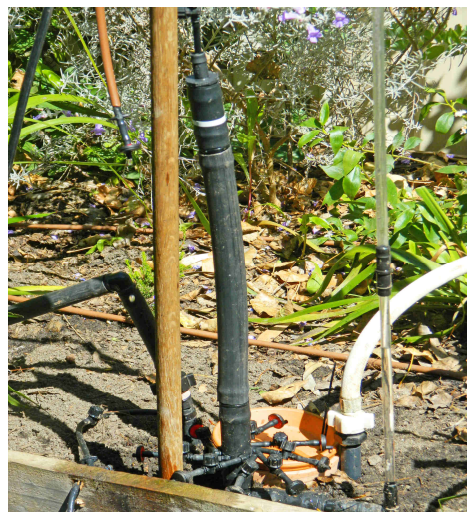
Fraction 1/8 for online dripper, water supply pressure 100 kPa. The extension tube is used so that the water level showing in the clear tube is below the white line.