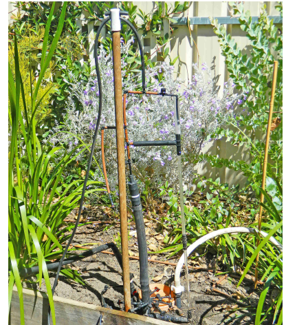
The fractional dripper is suspended above the terracotta pot

To make a fractional dripper for dripline you need to cut the dripline into short lengths with one dripper per length and one end blocked.