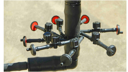
Each of the lower drippers is connected to a 4mm micro valve

Each of the lower drippers is connected to 4 mm polypipe connected to a 4 mm micro valve so that the outlet of the dripper is at the same level as the 4 mm elbows inserted in the 25 mm polypipe.