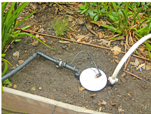
Step 3. Connect the water supply to the inlet pipe and connect the irrigation application to the outlet pipe.

Because the terracotta pot is in the ground near the roots of plants, the Unpowered Terracotta Irrigation Controller responds to changes in plant transpiration. As the crop grows and requires more water, the irrigation frequency increases automatically.