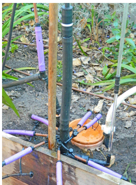
Fraction 1/2 for 13mm dripline (4 closed lower drippers, 4 open lower drippers and 2 open lower drippers as control dripper) water supply pressure 100 kPa