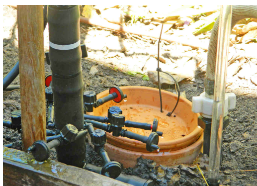
Fraction 1/4 for online dripper (4 closed lower drippers, 4 open lower drippers and one open lower dripper as control dripper) water supply pressure 100 kPa