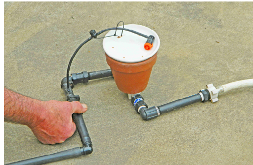
Connect the irrigation application to the outlet pipe