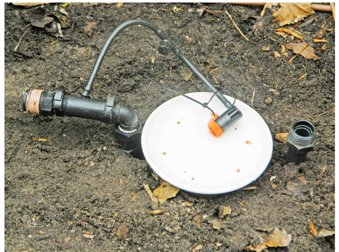
In ground installation of the Unpowered Terracotta Irrigation Controller