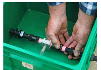
Connect the inlet pipe to the valve assembly

Step 5. Connect the outlet pipe to the valve assembly (use teflon tape).