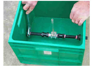
Tighten the internal backing nuts against the external round plastic nuts

Step 7. Attach the inlet adaptor to the inlet pipe (use teflon tape). Note that the inlet side of the valve extends farther than the outlet side.