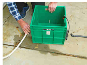
Connect the water supply to the inlet side of the evaporator

Step 9. Connect the water supply to the inlet side of the evaporator.