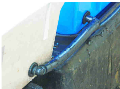
Connecting two evaporators

You can decrease the surface area of evaporation by placing full bottles of water in the evaporator.