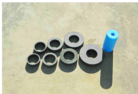
Cylindrical float and seven float rings

To increase the options for the irrigation frequency, the DIY Unpowered Measured Irrigation Controller Kit is provided with an adjustable float consisting of a 7 cm diameter cylindrical float and 7 float rings that can slide over the cylinder to increase the outside diameter of the float (the bottom of the float ring should align with the bottom of the cylindrical float).