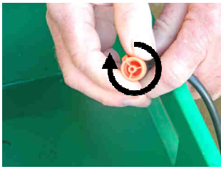
Turn the control dripper clockwise to reduce the flow rate

If your plants are getting too much water, turn the control dripper anticlockwise to increase the flow rate of the control dripper.