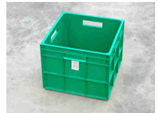
A hobby box makes an ideal evaporator

Step 1. Choose a suitable evaporator. The evaporator is a plastic container with vertical sides with an opening of at least 20cm x 20cm and a height of at least 15cm (a hobby box is ideal).