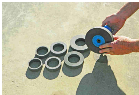
Slide the float ring over the cylindrical float

The following table shows the irrigation frequency for various float rings. The irrigation frequency is determined by the net evaporation from the evaporator between irrigation events.