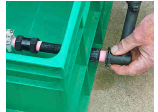
Attach the adjustable control dripper assembly to the outlet pipe

Step 8. Attach the adjustable control dripper assembly to the outlet pipe (use teflon tape).