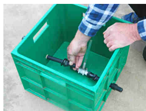
Insert the outlet pipe through the other hole

Step 4. Insert the outlet pipe through the other hole in the evaporator so that the washer is inside the evaporator. Attach the other round plastic nut.