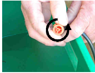
Turn the control dripper anticlockwise to increase the flow rate