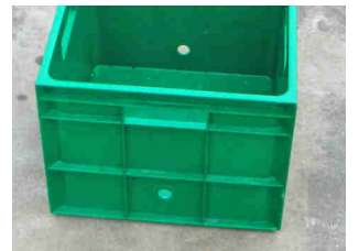
Drill 2 holes in opposite sides of the evaporator

Step 2. Drill two 20mm holes opposite each other in opposite sides of the evaporator. The centres of the holes should be no more than 5cm higher than the bottom of the evaporator.