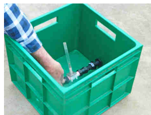
Insert the inlet pipe through one of the holes

Step 3. Insert the inlet pipe (connected to the valve assembly) through one of the holes in the evaporator and attach one of the round plastic nuts.