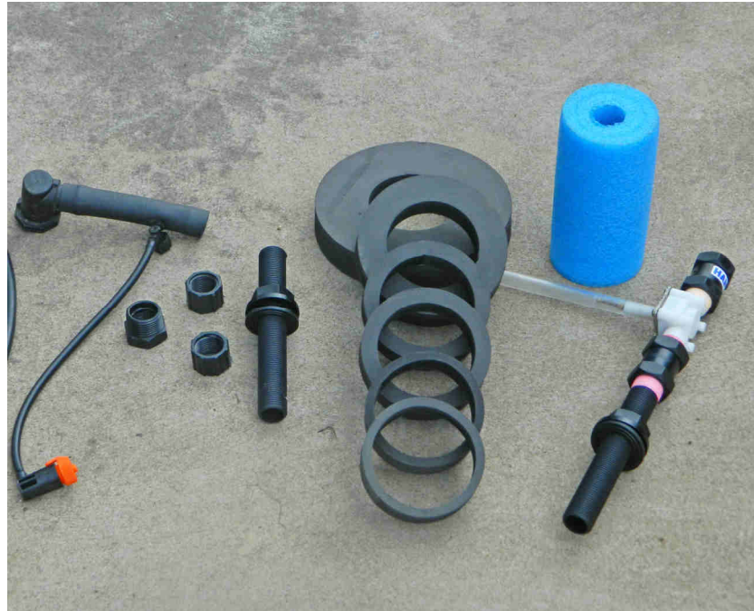
DIY Unpowered Measured Irrigation Controller Kit