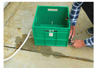
Connect the irrigation system to the outlet side of the evaporator

Step 10. Connect the irrigation system to the outlet side of the evaporator.