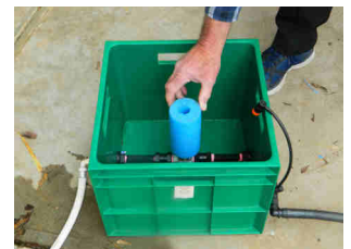
Slide the cylindrical float shaft over the float shaft

Step 12. Slide the cylindrical float shaft over the float shaft.