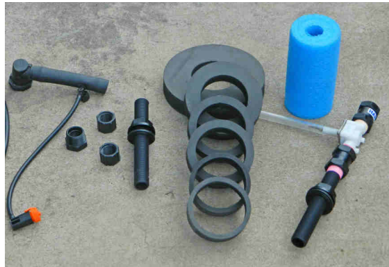
Components in the DIY UMIC Kit

Step 1. Choose a suitable evaporator. The evaporator is a plastic container with vertical sides with an opening of at least 20cm x 20cm and a height of at least 15cm (a hobby box is ideal).