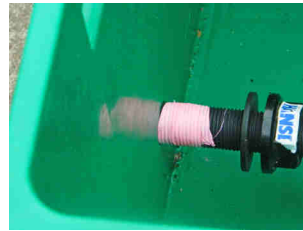
Wrap teflon tape around the inlet and outlet pipe

Step 6. Wrap teflon tape around the inlet pipe and the outlet pipe as close as possible to the sides of the evaporator. To prevent water leaking from the evaporator, tighten the internal backing nuts against the external round plastic nuts.